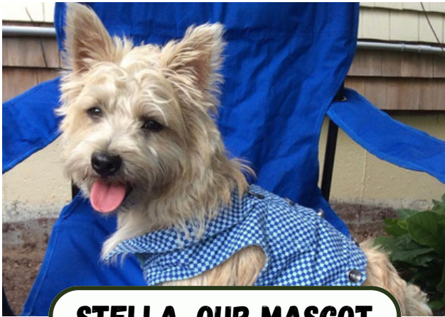
STELLA, OUR MASCOT

Stella, our Norwich Terrier, has been entertaining our Noble Care guests for the past couple of weeks. She enjoys the excitement of the center and the many treats she gets under the table. Our guests are excited to have this furry companion throughout the day.